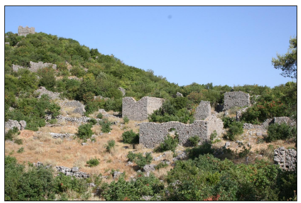
Fig. 4 View of the plaza Qafa e Pazarit

The rest of the plan is occupied by the residential function, except the top of the hill on the west where are constructed two tower houses. They were built on a dominant position and their plan<sup>14</sup> suggest a mixed function: observation and residential<sup>15</sup>.