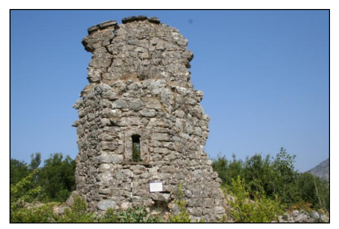
Fig. 2 Church of Jominai, view of the apse from the outside

The second survey has been made in the left side of the source of Vrizi, on the east of Kamenica, at the Mira's gorge. There has been found the ruins of many houses and a church called by the habitant's church of Jominai<sup>12</sup> (Fig. 2). The church with a very interesting plan, is surrounded by continued wall lines on the east and north. It is situated in the southeast of a small valley. The ruins of the houses are similar to the ones in Kamenica by the structure and position. On the west of the village of Palavli<sup>13</sup>therehas been found the ruins of a church. It is positioned on the top of a small and soft hill immediately outside Palavli (Fig. 1). The survey made possible to sketch down the plan of the church. The individuation of the extents of the plan of this neighbourhoodwas made impossible by the construction of the village of Palavli, which has ruined the stratigraphy of the area.